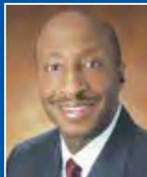
Kenneth C. Frazier , Executive Chair of the Board, Merck and Co., Inc. (2017)