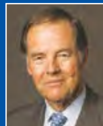
The Honorable Thomas H. Kean , 48th Governor of New Jersey (2014)