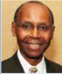
The Honorable James H. Coleman, Jr. , Former Justice, Supreme Court of New Jersey (2014)